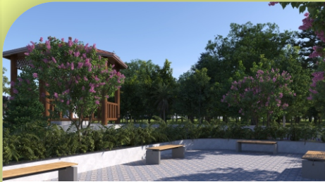
Sitting Area With Benches