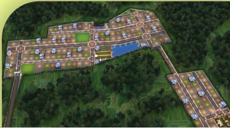
2 ft Wall Compound For Individual Plot