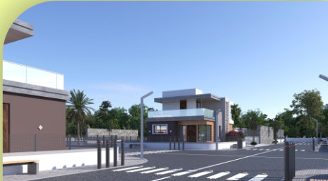
Safety Features Like Road Studs, Speed Breakers