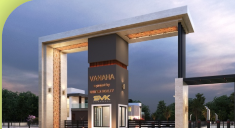
Security Entrance Gate